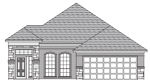
Elevation B (with stone)

For more information, visit www.mckinleyhouston.com