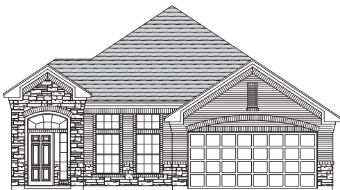
Elevation A (with stone)